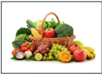
Fruits & Vegetables