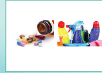
Medicines & Chemicals