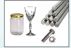
Glass / Metal