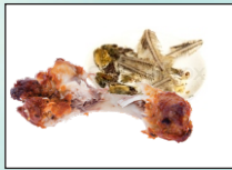
Poultry & Fish