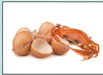
Egg & Crab Shells